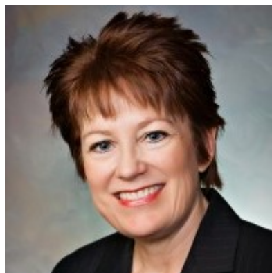
Senator Nancy Barto